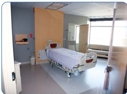
Patient rooms maximize natural lighting and allow individual room comfort control.