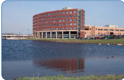
The new Sherman hospital replaces an outdated facility. A 15 acre man-made pond serves as the heat sink/source for the geothermal heat pumps.