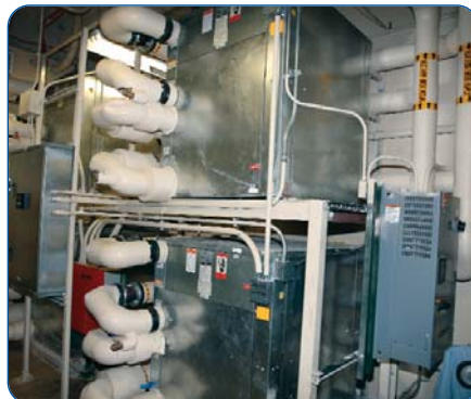
66 Mammoth water-to-water heat pumps installed inside Governair rooftop air handlers that provide fresh air to the hospital.