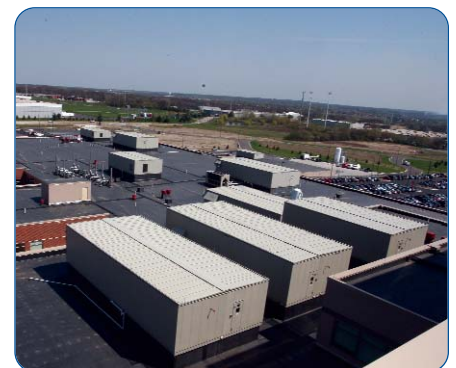
Most of the mechanical plant equipment is housed within custom rooftop air handlers by Governair, thereby conserving interior space for hospital functions.