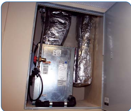
Individual room heat pumps are accessible for inspection or service through corridor enclosures, eliminating any disturbance of patient care.

The Governair air handlers provide filtered, conditioned air to various administrative areas in the hospital, as well as providing conditioned ventilation air for the local heat pumps serving the rest of the building. The enclosure design emphasizes rugged construction and each unit is built to match the equipment it will house.